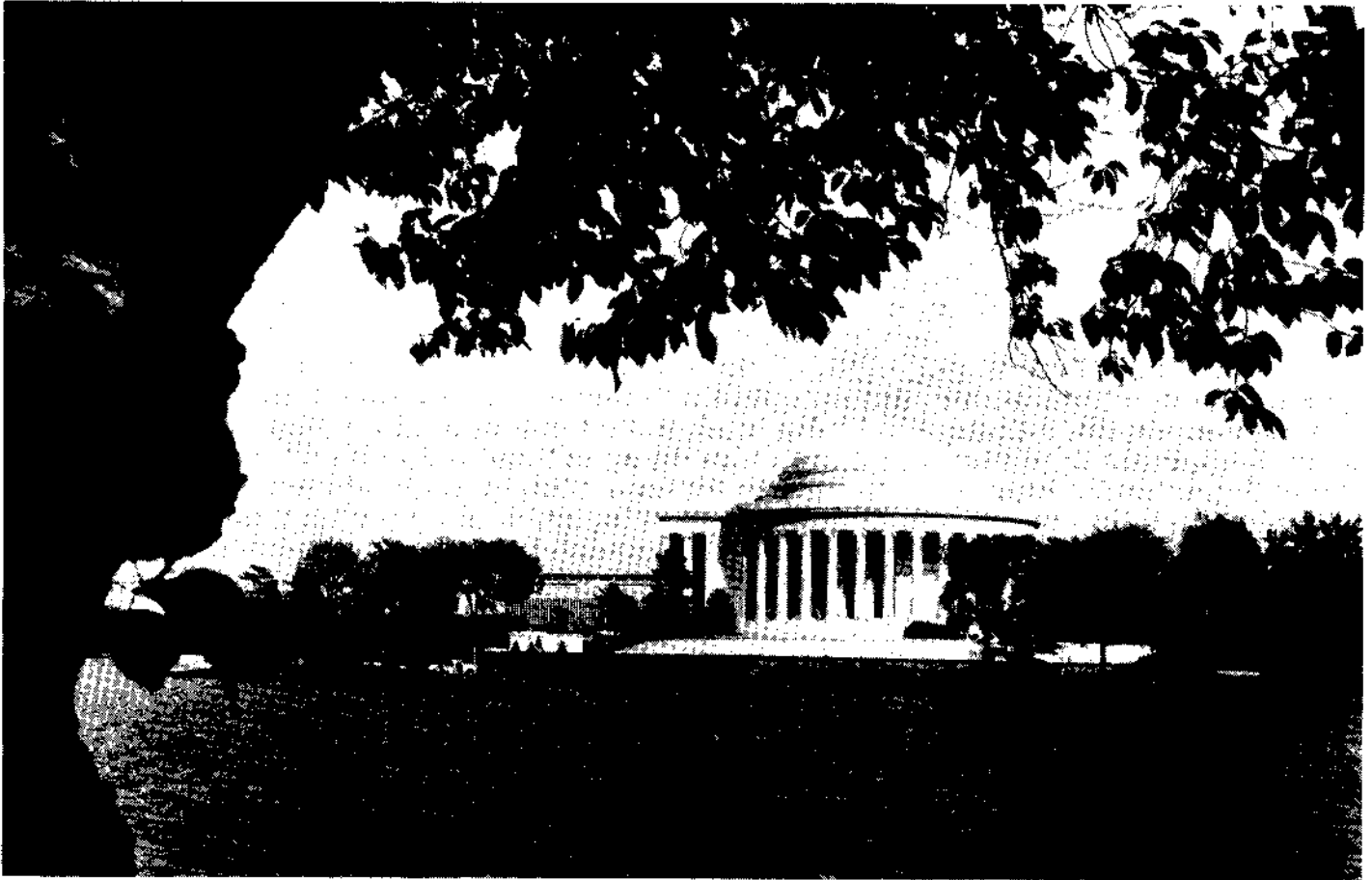
JEFFERSON MEMORIAL, WASHINGTON, D.C.

The constitution may be amended or rescinded by two-thirds of those voting. The Bylaws may be amended or rescinded by a majority of those voting.